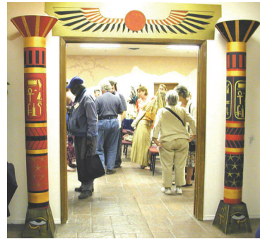
Entrance to the Initiation Chambers

sey, and Paul Brewer. The conference culminated with a speaker's panel which included all of the presenters plus Vicki Brewer, the designer of the new Brotherhood of Light color tarot cards.