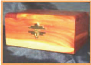
Cedar Tarot Box with lock—$20.00