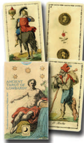
Ancient Tarot of Lombardy $19.95

Send Orders to: The Church of Light 2119 Gold Avenue SE Albuquerque NM 87106 churchoflight@light.org 505-247-1338 800-500-0453 Fax: 505-814-7318