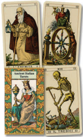
Ancient Italian Tarot—$22.95